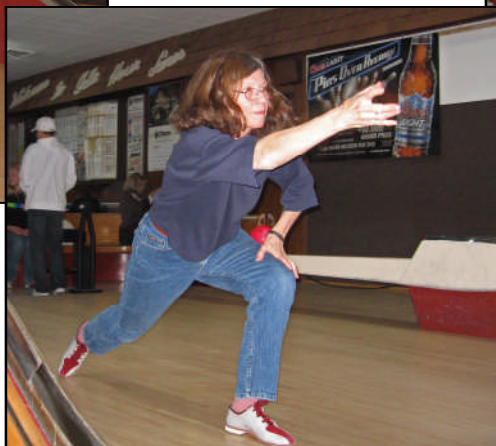
Who's your Daddy?