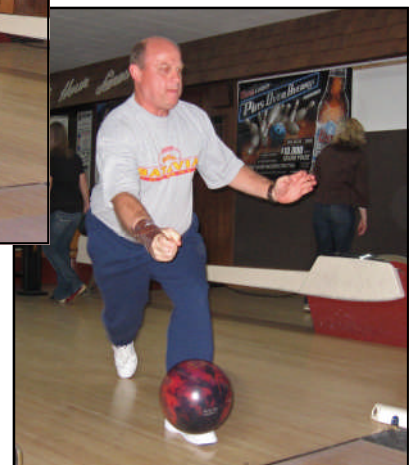
Oh yeah, I'm lookin' good!