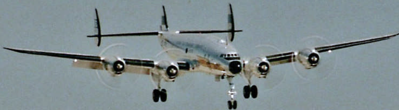
MAC Connie on short final to 18 right, Oshkosh '95

Note: The Fox Valley Sport Aviation Association—EAA Chapter 579 does not project or accept any responsibility for the participation by any newsletter reader or Chapter member at any fly-ins, functions, forums, or events that may be publicized in this newsletter. All material herein of a technical nature is for reference only and is not necessarily recommended or approved by the editors of this publication or any official of the Fox Valley Sport Aviation Association—Chapter 579. It is up to the individual reader to determine the legality and veracity of anything appearing in this newsletter. This publication is produced only as a medium of communication amongst members and friends of the Fox Valley Sport Aviation Association—EAA Chapter 579.