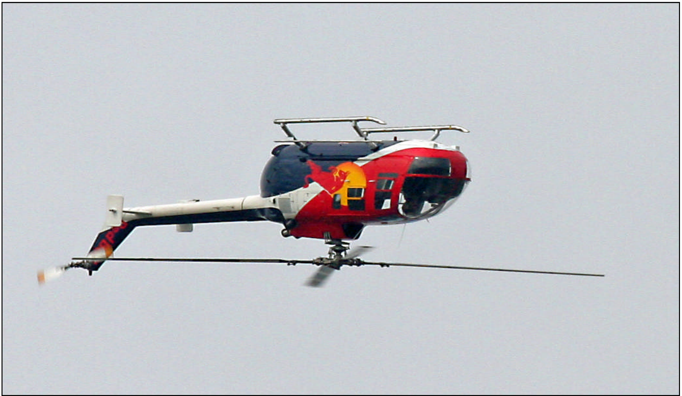
Red Bull's Messerschmitt Boelkow Blohm BO105CBS, Oshkosh, 2008. Yes, the helicopter really is flying upside down!

Note: The Fox Valley Sport Aviation Association—EAA Chapter 579 does not project or accept any responsibility for the participation by any newsletter reader or Chapter member at any fly-ins, functions, forums, or events that may be publicized in this newsletter. All material herein of a technical nature is for reference only and is not necessarily recommended or approved by the editors of this publication or any official of the Fox Valley Sport Aviation Association—Chapter 579. It is up to the individual reader to determine the legality and veracity of anything appearing in this newsletter. This publication is produced only as a medium of communication amongst members and friends of the Fox Valley Sport Aviation Association—EAA Chapter 579.