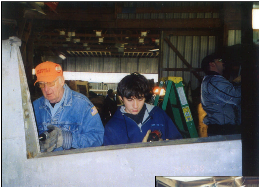
More Photos of "The Desert Rat" By Art Sereque