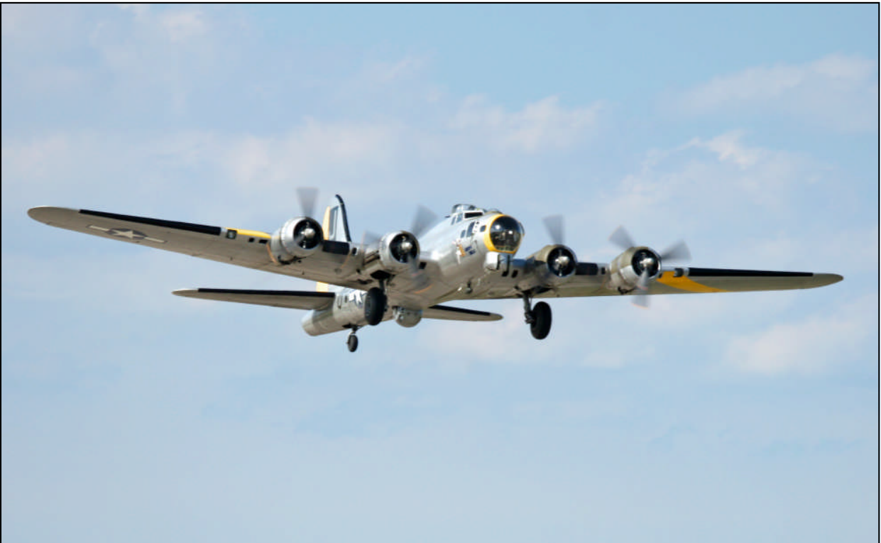
B-17 at Oshkosh

Note: The Fox Valley Sport Aviation Association—EAA Chapter 579 does not project or accept any responsibility for the participation by any newsletter reader or Chapter member at any fly-ins, functions, forums, or events that may be publicized in this newsletter. All material herein of a technical nature is for reference only and is not necessarily recommended or approved by the editors of this publication or any official of the Fox Valley Sport Aviation Association—Chapter 579. It is up to the individual reader to determine the legality and veracity of anything appearing in this newsletter. This publication is produced only as a medium of communication amongst members and friends of the Fox Valley Sport Aviation Association—EAA Chapter 579.