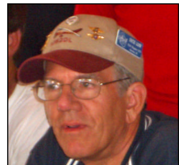
President EAA Chapter 579