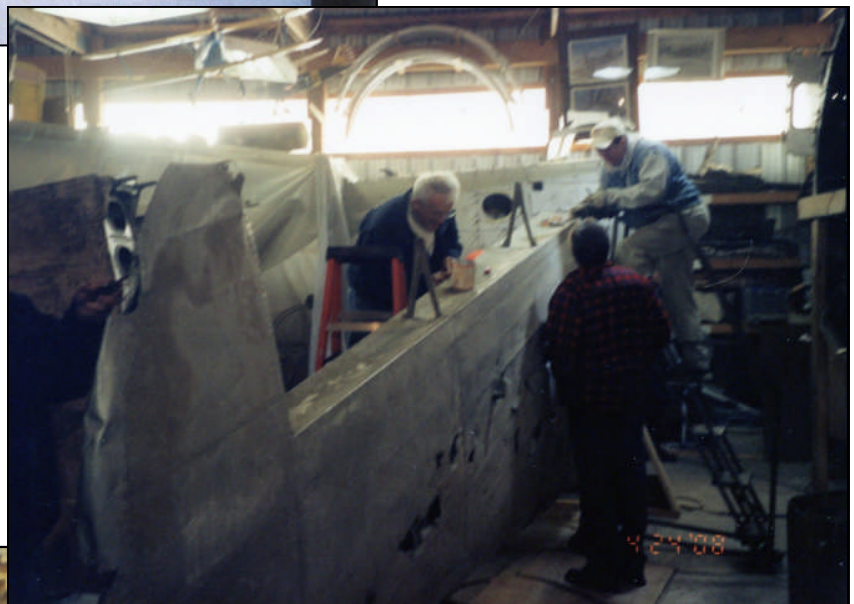
Volunteers working on Horizontal Stabilizer